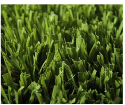
Tape form (slit-film)